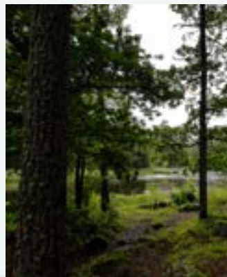
Färnebofjärden National Park, nearby our course venue